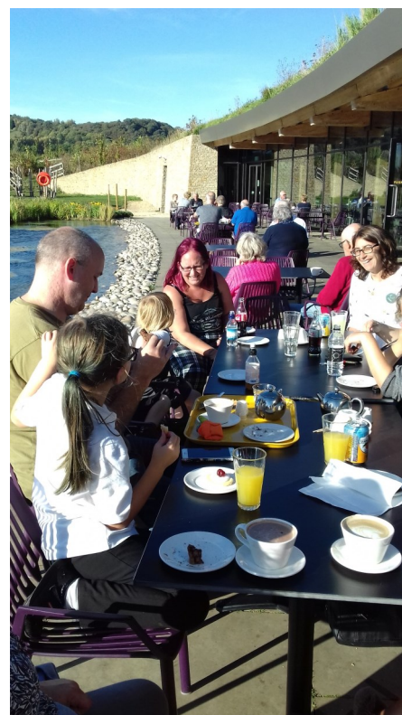
Members of APT volunteer team and the children's Garden Gang enjoying tea at the M5 Gloucester Services after planting herbs in the Community garden.

We have amazing links through our partner organisations based around Gloucestershire. Play Gloucestershire are in Stonehouse every Tuesday and the Play Rangers are soon to move their afternoon sessions, 4pm to 6pm to the Three Greens in Park Estate. Fair Shares hold their monthly meetings at APT and as partner organisations we are soon to link up and provide walks as part of the Stonehouse walks festival and hopefully continue with the walks through-out the year. So you can see that the volunteer team at APT are always busy, providing our Community with projects and activities to enhance life in the town of Stonehouse and the surrounding community. Come and see what we do in the hub on Park Parade at the junction of Park Road and Elm Road. The kettle is always on.