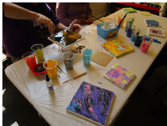
Free Flow Acrylic Art