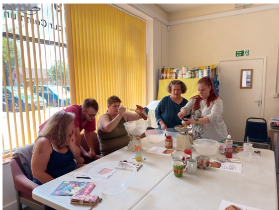
Cooking on a Budget

Here are some more of the courses & activities that the team at APT have organised over the last few months. Don't forget if you would like to join in with any of the activities or courses, to save disappointment, book your place by either visiting APT or ring the office number: 01453 822705.