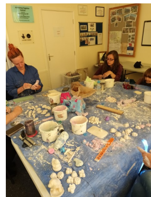
Free Flow plaster